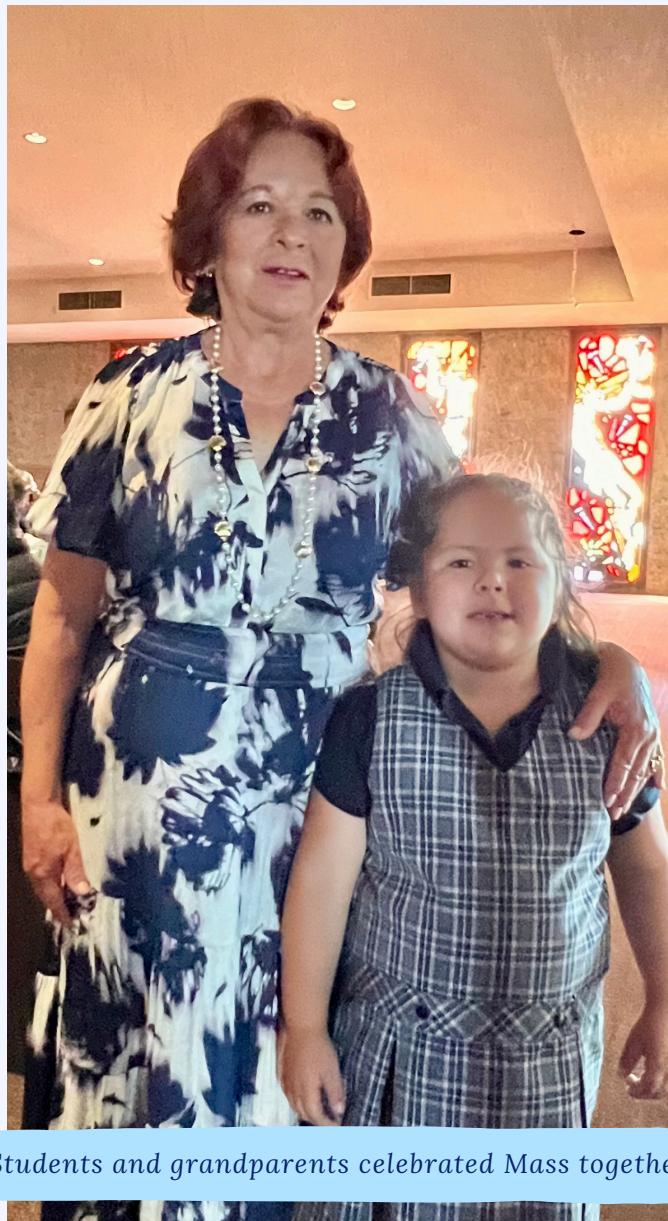
Students and grandparents celebrated Mass together