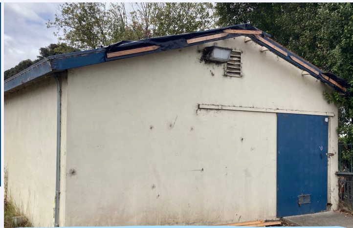
The MDS shed waiting to be revitalized

As we continue to envision this space, we'd love to hear from our alumni. We're considering ways to incorporate a dedicated alumni area within the new space—somewhere we can proudly display graduating class photos and celebrate the generations who have come before. Your ideas, memories, and support could help shape this space into something truly meaningful for both current and future students.