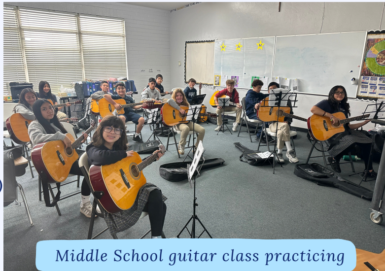
Middle School guitar class practicing

For both the middle school and younger students, Madonna has made a strong investment in enrichment, offering dedicated instruction in art, music, Spanish, and physical education. These opportunities allow students to explore their talents and develop essential skills beyond core academics.