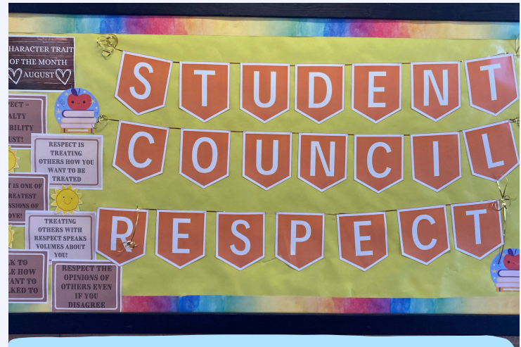
MDS Virtue Program trait of the month board