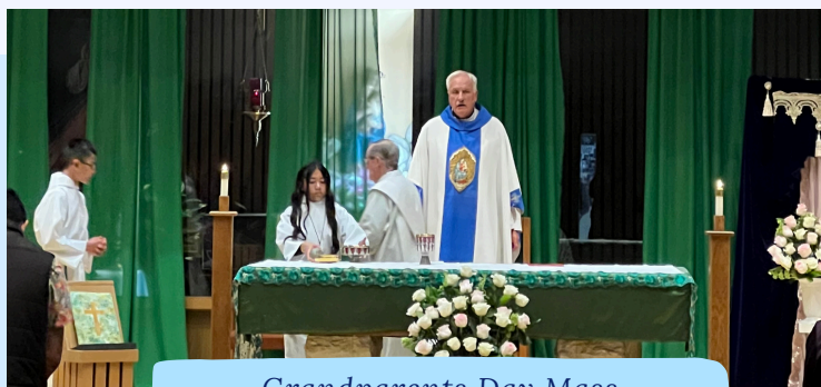
Grandparents Day Mass