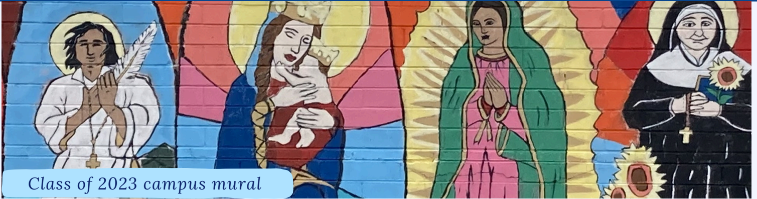
Class of 2023 campus mural