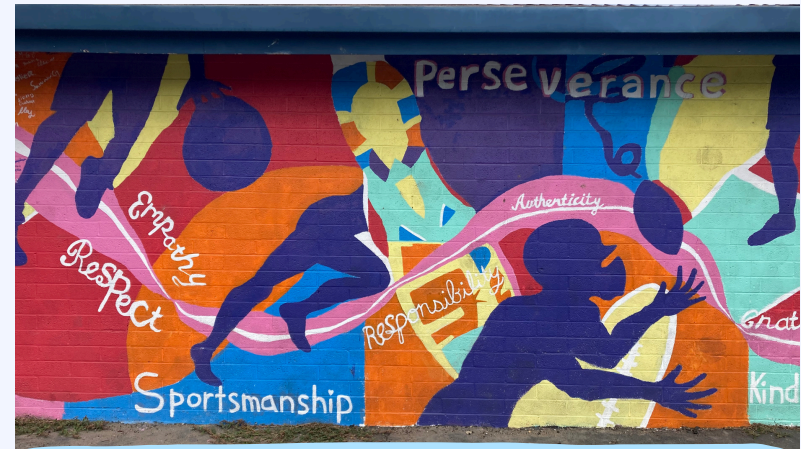
Class of 2024 mural painted outside of Room 8

We’d love to hear your story! Whether you’re near or far, teaching or traveling, let us know where life has taken you after Madonna del Sasso. Email us at crowe@mdsschool.com to be featured in an upcoming edition!