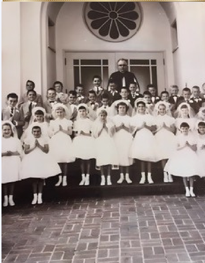
MDS First Holy Communion, 1958-1959, at Sacred Heart Church