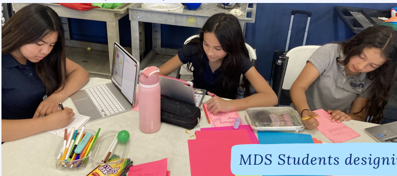
MDS Students designing cards for seniors

The completed cards will be distributed to seniors throughout the region through the Alliance on Aging organization, helping celebrate Mother's Day and Father's Day while reminding recipients that they are remembered, valued, and loved.