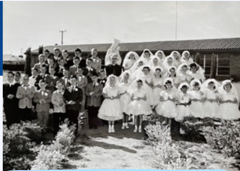
MDS 2nd grade First Holy Communion, 1959-1960