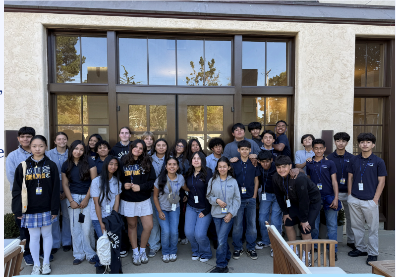
8th grade field trip to the Sunset Center