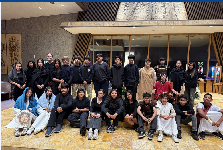
8 th grade students reenacting the Stations of the Cross

Another beloved spring tradition was the school's May Crowning celebration honoring the Blessed Virgin Mary. In preparation for the event, every student was invited to bring a flower from their garden or purchase one to contribute. The flowers were collected in vases, and each class presented their arrangements around the statue