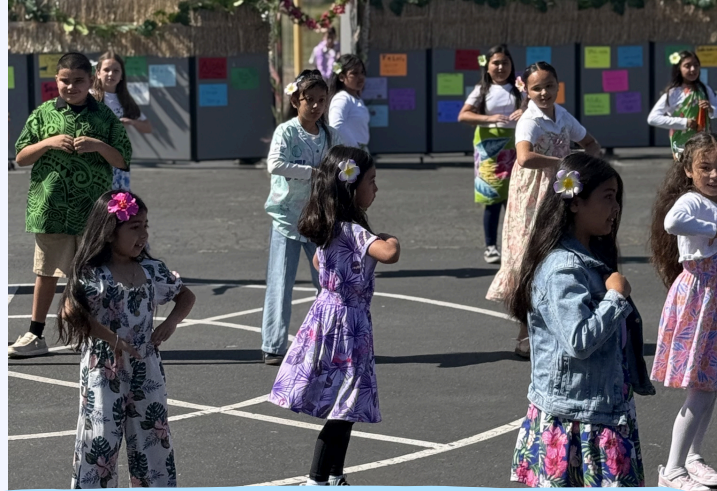
MDS student performers at the Asian Pacific Food Festival

As students traveled from table to table, they experienced new flavors and learned firsthand about cultures from around the world.